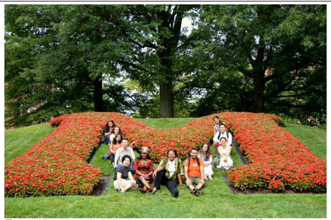
Team-building and experiential learning are important components of your Humphrey seminar.

As a core part of your Fellowship, you are required to attend the special year-long Humphrey Seminar organized for you by your university. This seminar explores how to be a global leader, provides support to you and your Humphrey colleagues as you share approaches to common problems, and introduces you to many aspects of U.S. culture and society. You should plan to make presentations and share information regarding your professional activities, plans and your work in your home country as a part of the seminar. You will be required to help plan the seminar, providing an important opportunity to work together with the other Humphrey Fellows at your university.