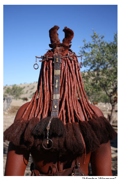
"Himba Woman" Namibia, 2012

The Office of Study Abroad and the Office of Career Services and Placement offer this interactive and highly informative workshop to give students the information and skills they need to effectively present their study abroad experience in their resume and application cover letters, and during job interviews.