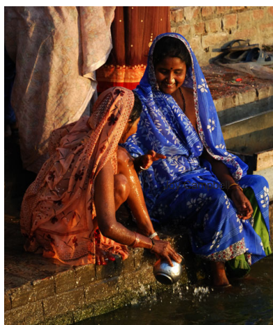
“Cleansing Time” Nepalgunj, Nepal, 2007