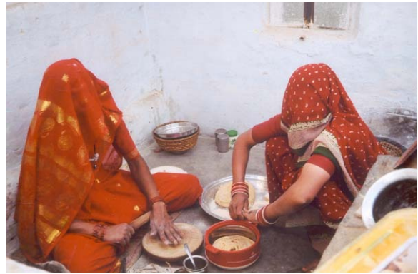
"Veiled View" Rajasthan, India, 2004 Megan Halladay

Nominations for the 2013 International Awards Ceremony are now open. The nomination deadline is 5:00 pm on Monday, December 17, 2012. Nomination forms can be found at: www.isp.msu.edu/awards/awards.htm