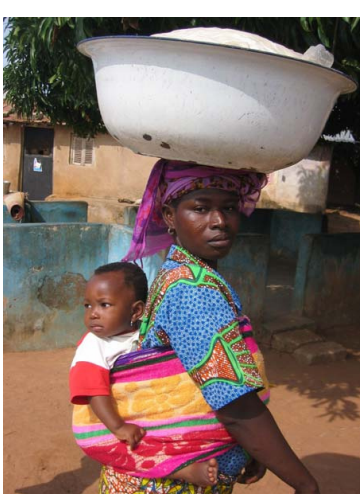
"La familia unida" Ejura, Ghana, West Africa 2004

Center for Advanced Study of International Development 427 North Shaw Lane International Center Room 202 East Lansing, MI 48824-1035 517/353-5925 www.casid.msu.edu