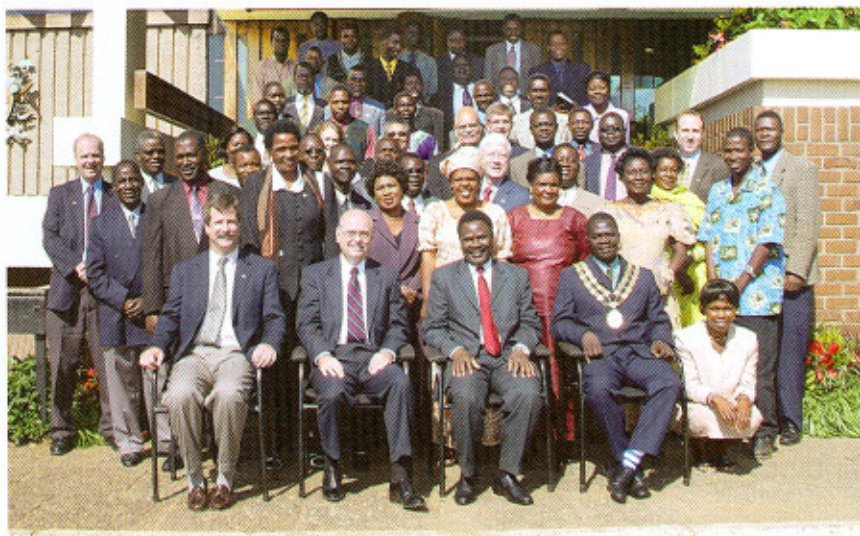
Workshop Attendees, Lilongwe, Malawi (June 2003)