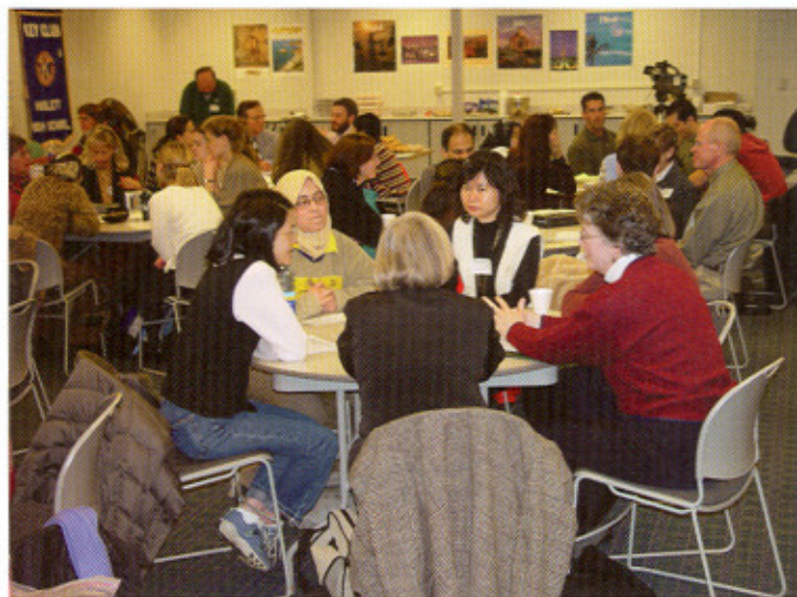
LATTICE Session, Hasslet, Michigan (November 2003)