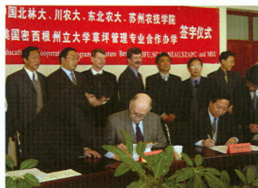
MSU Delegates and Chinese University Officials at signing ceremony

Phone 517.353.5925 Fax 517.353.8765 www.isp.msu.edu/casid