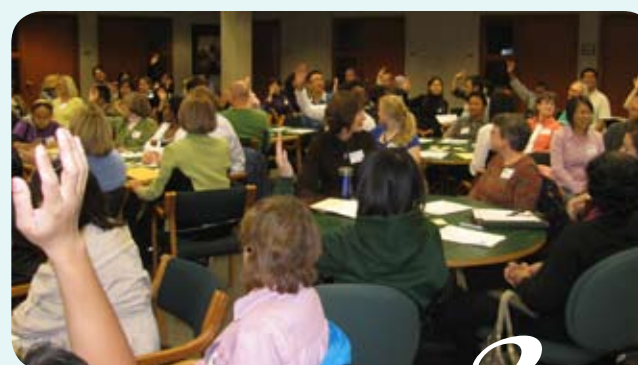
LATTICE members participate in discussion.

The program is supported by CASID and MSU's College of Education, the Office of the Dean of International Studies and Programs, African Studies Center, Asian Studies Center, the Center for Latin American and Caribbean Studies, GenCen, the Graduate School, and ten mid-Michigan school districts.