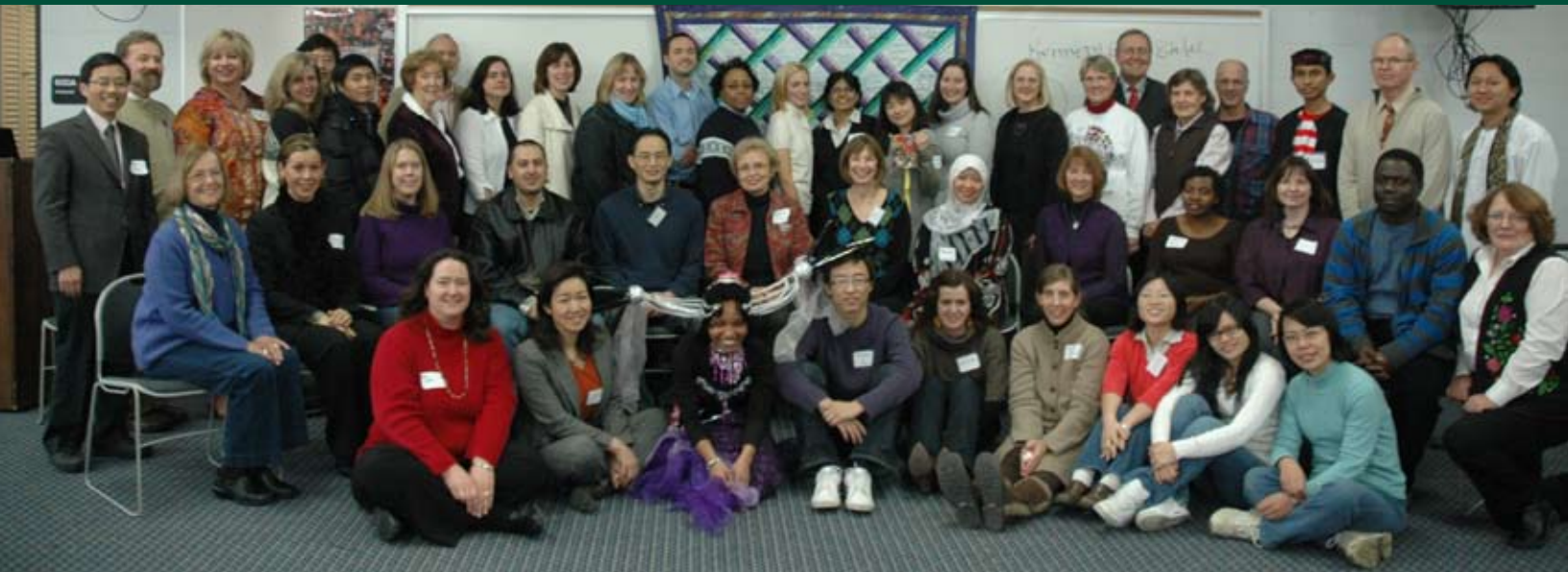
LATTICE participants 2009-10.