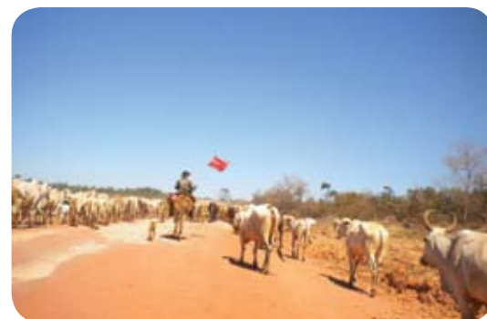
Gaúcho moving cattle near the border between Pará and Mato Grosso states, on the BR-163 highway in the central Amazon (August 2009).