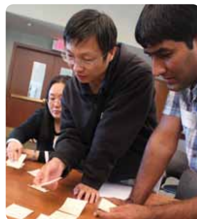
September 2013 session participants engaged in a small group activity

If you would like to get involved with LATTICE contact lattice@msu.edu or look for MSU LATTICE on Facebook.