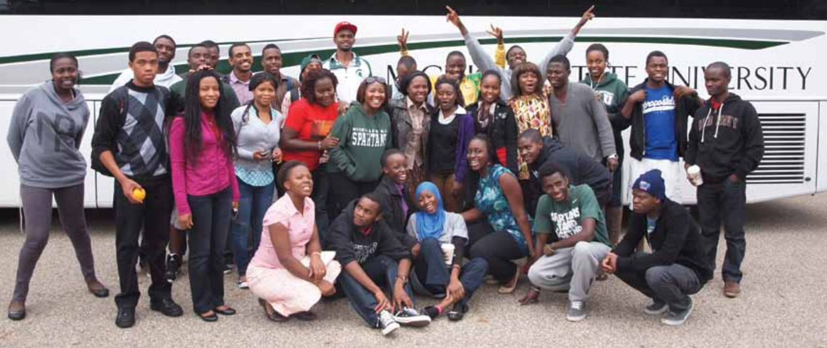
The 2013-14 MSU MasterCard Foundation Scholars