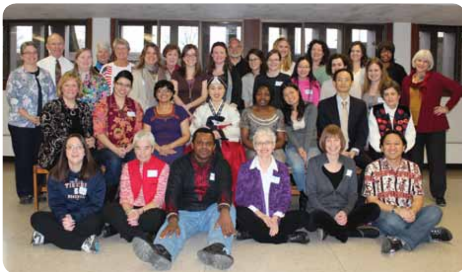
LATTICE participants for 2012-13