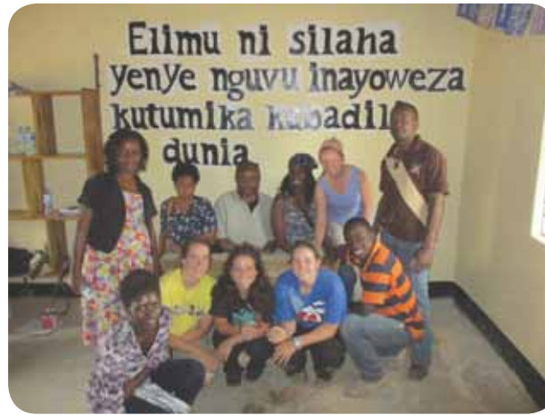
MSU SCDT students with fellow University of Dar es Salaam. Students work together to paint and refurbish the teacher staffroom of the community school in Naitolia, Tanzania