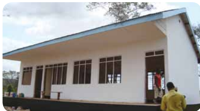
The completed Ngwenya pre-primary school