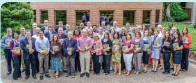
Participants from the 10th Biennial International Business Institute for Community College Faculty