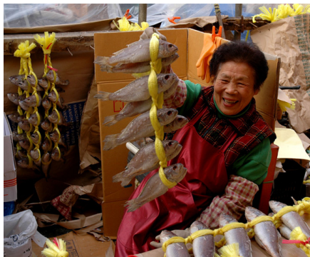
“Fancy ‘Well Dressed’ Fish” Gyung Dong Shi Market, Seoul, Korea, 2006