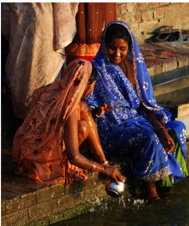
“Cleansing Time” Nepalgunj, Nepal, 2007