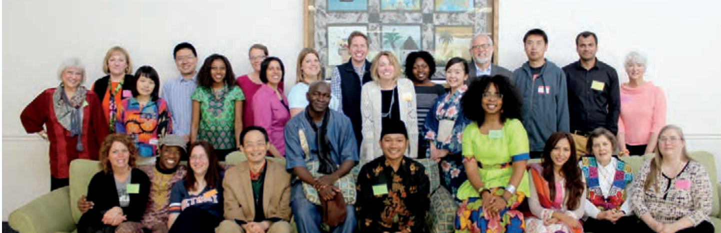
LATTICE participants in 2015.