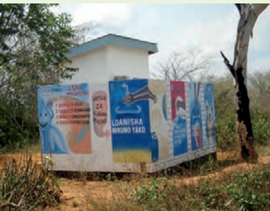
One of the ventilated improved pit latrines with murals explaining proper sanitation and hygiene constructed by TPP in 2015.

TPP's innovative approach to sustainable development has brought about remarkable changes in Milola and Naitolia. The facilitated engagement and collaboration among MSU and international researchers, students, and community members continues to shape a positive future for these Tanzanian villages.