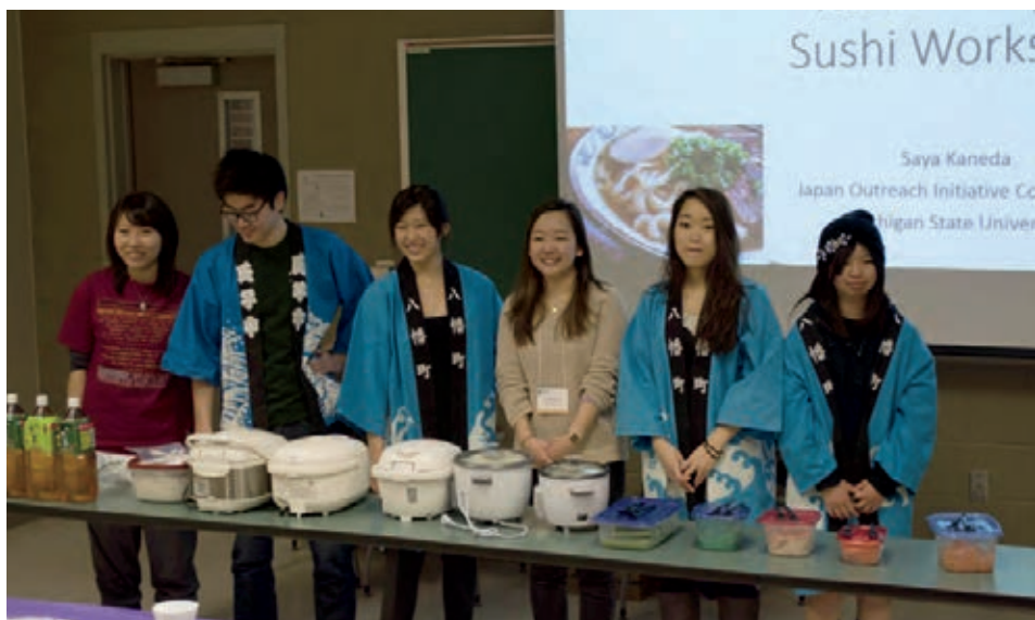
The MSU Japan Club shows attendees of World Language Day how to make sushi.