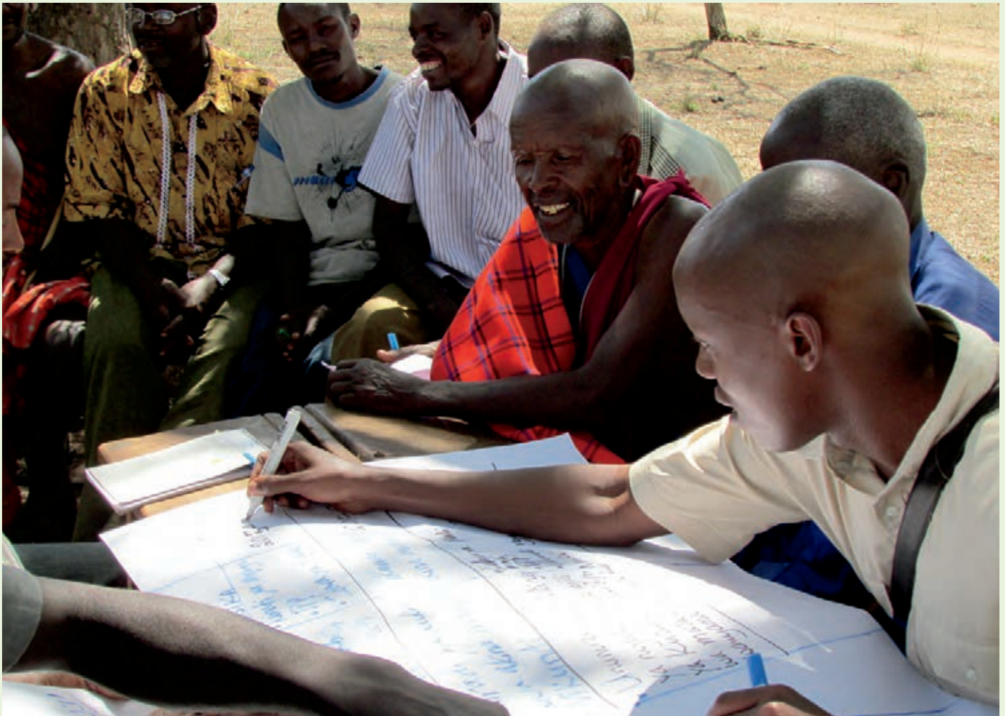
The Monduli District planning officer works with community members on a participatory mapping projects.