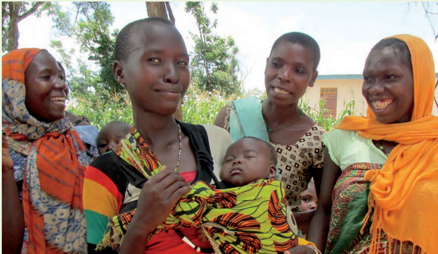
Mothers and children in the Milola B subvillage of Ngwenya.

The MSU Tanzania Partnership Program (TPP) is a long-term collaborative alliance of local and international organizations dedicated to improving local livelihoods and promoting community resiliency in Tanzania. TPP addresses community-identified needs through a participatory and integrated approach that draws on local and international expertise. This approach provides fertile ground for development-related research, forms the foundation for development activities, and opens a space for a community engagement-focused study aboard program. TPP began its work in two pilot villages in 2009—Milola, in the southern region of Lindi, and Naitolia, in the northern region of Arusha. In 2015, TPP began to expand its efforts to adjacent villages. With support from TPP funders, including the program's primary funders Gerald A. and Karen A. Kolschowsky, and overseas partners, TPP is making a difference in these communities by promoting increased access to quality education; improving health, sanitation, and hygiene; supporting greater access to and better quality of water; increasing agricultural production and food security; and improving animal health and productivity.