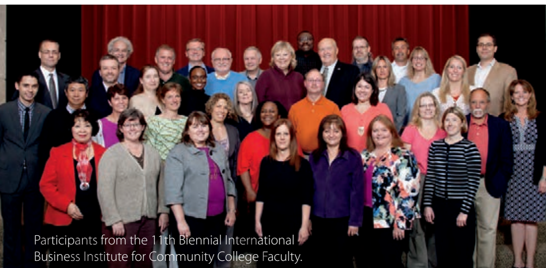
Participants from the 11th Biennial International Business Institute for Community College Faculty.