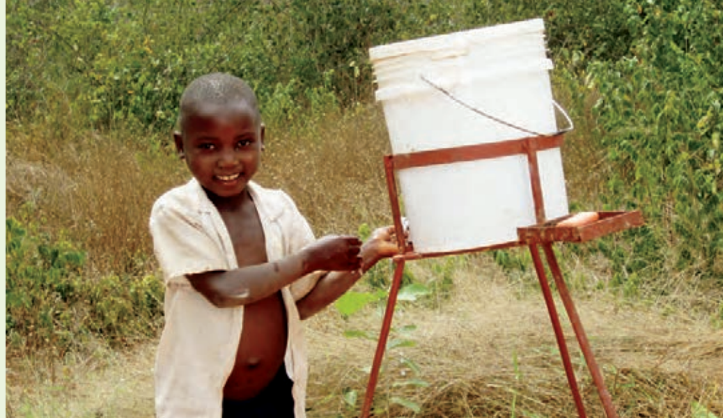
A student in Ngwenya using the hand washing station.

the different actors (organizations, committees, associations, etc.) and institutions (property rights, policies, informal rules, etc.) that play a role in the natural resources and agriculture management in Mswakini Ward and how these relations interact at different levels. This analysis included an investigation into the institutional decision-making process in regards to natural resource conservation and development programs.