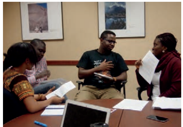
MasterCard Foundation Scholars at MSU discuss professional regional cooperation as part of the Leadership Academy for African Development series.

MSU is committed to sharing knowledge and seeking institutional partners to find practical solutions to the major problems facing Africa today, including hunger, malnutrition, and youth unemployment. The MasterCard Foundation Scholars Program has further strengthened MSU’s engagement with Africa; scholars are returning to Africa with the knowledge and skills to make real change in their communities and across the continent.