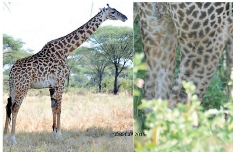
Giraffe at Ruaha National Park in Tanzania.