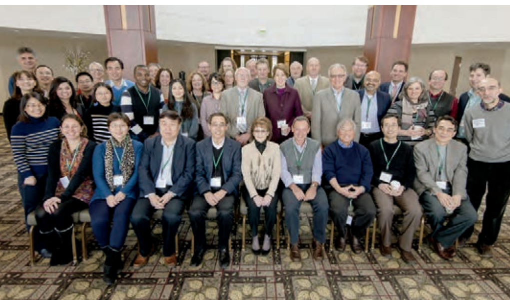
Participants at the International Workshop on Future Earth—Science and Technology for Society.