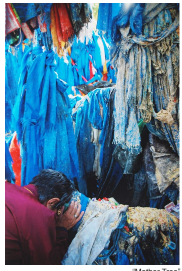
"Mother Tree" Sukhbaatar, Mongolia, June 2009

Center for Advanced Study of International Development