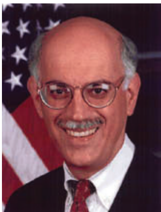
Andrew S. Natsios, USAID Administrator

In October 2004, MSU hosted a campus visit by U.S. Agency for International Development (USAID) Administrator Andrew S. Natsios. Administrator Natsios is a graduate of Georgetown University and Harvard University's Kennedy School of Government where he received a master's degree in public administration. During his visit to MSU, Administrator Natsios gave a presentation titled, "Sudan, Darfur, and the United States Response." The presentation, attended by over 100 faculty and students, provided a first-hand account of conditions in Sudan.