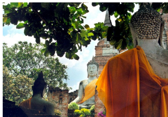
"Meditation" Thailand, 2003 Linda Roberts